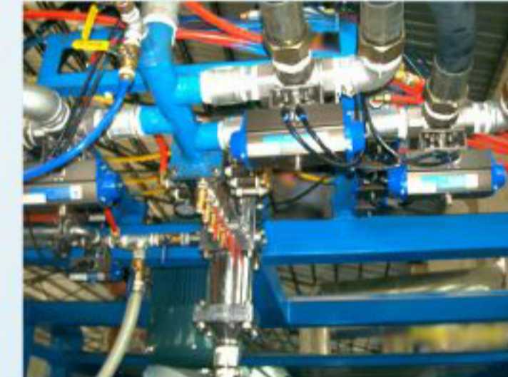
混合头 Mixing head