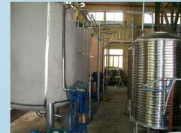
大料储料罐 Big material tank