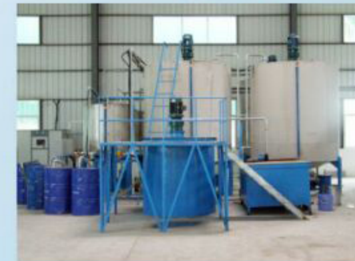
大料储料罐 Big material tank