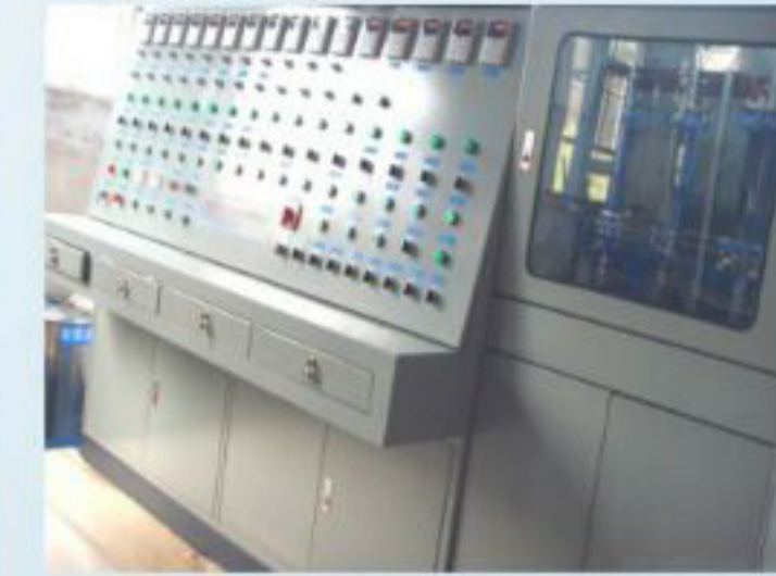
控制柜 Control box