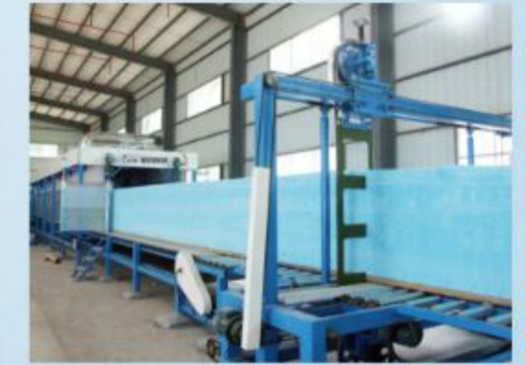
裁断机 Block cutter machine