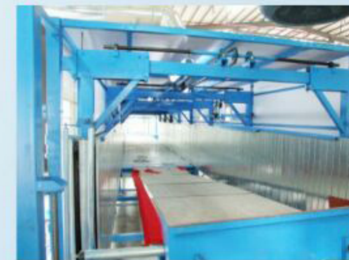
烘道 Foaming Oven