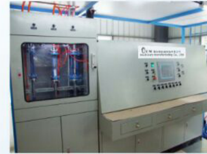
控制柜 Control box