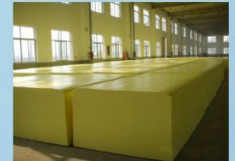
泡绵成品 The Foam